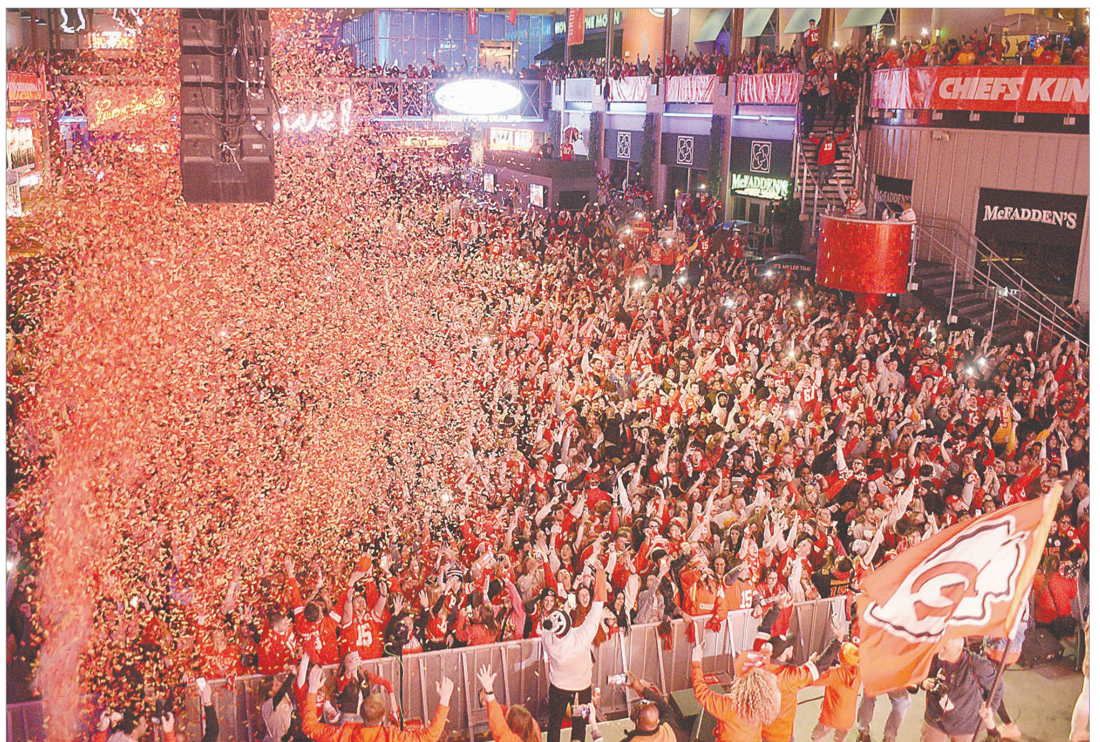
Confetti cannons shoot off above the crowd after the Chiefs win the Super Bowl on Sunday at the Power and Light District in Kansas City, Mo. The score was close with the Chiefs winning by one field goal