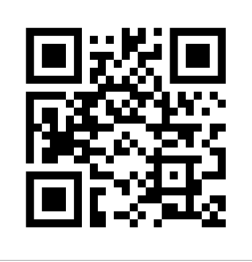
Scan here to view a micro documentary about 54 Country

A crowd of dancers fill the dance floor on Jan. 28 at 54 Country in Fulton. Line dancing to country classics and more modern selections happened all night while the crowd danced in sync.