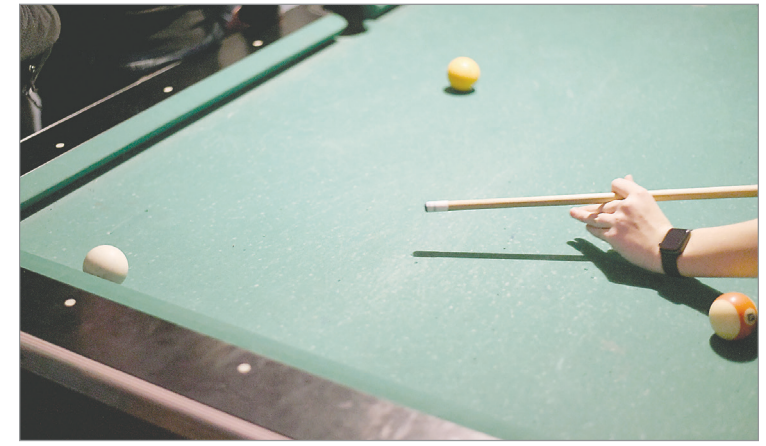
A patron sets up a pool shot on Jan. 28. Besides a large dance floor, 54 Country attendees can also shoot pool in the back.

The Kleindienst family hopes to reopen in the Kingdom City area by November 2023. This time, they are building from the ground up. The building will include both a wedding venue and a dance hall.